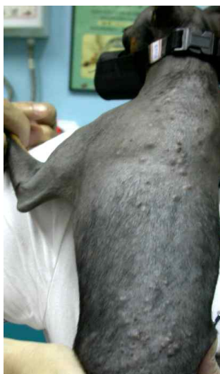
Fig 3. Skin lesions before treatment showed severe lesions can be seen over the body.

In addition, the authors administered herbal medicines in the current case. Shyr Wey Bay Du Tang contains Radix Bupleuri, Cortex Pruni, Radix Platycodi, Rhizoma Ligustici, Hoelen, Radix Angelicae Tuhuo, Radix Sapo Shinkoviae, Radix Glycyrrhizae, Rhizoma Zingiberis Recens and Herba Schizonepetae. The main effect of Shyr Wei Bay Du Tang is the removal of inner and outer Xi and detoxification, and it can be used for the treatment of conditions such as frunkle, pustule, phlegmone, lymphangitis, inflammation of