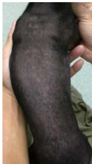
Fig 4. Recovered skin lesions after treatment reveal almost normal finding.